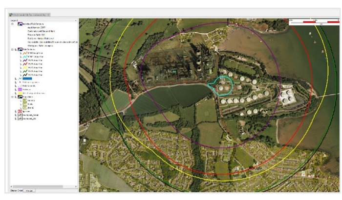
Individual Risk (IR) contours