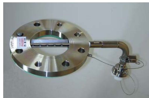
90 Degree Line Sampler

The Angular Line Sampler can also be used with the Enhanced Model DLS-002.