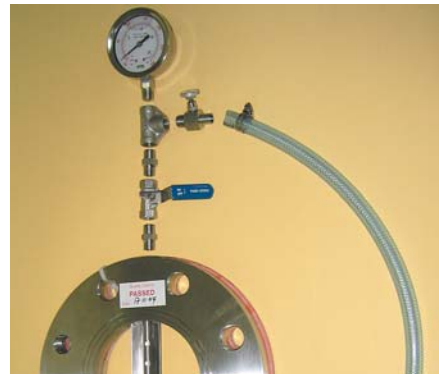
ADDITIONAL ACCESSORIES OF ENHANCED LINE SAMPLER DLS-002

The flexible hose should be fitted with the drain valve and properly clamped.