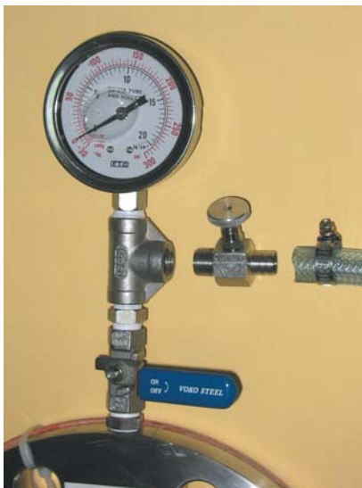
PRESSURE GAUGE ASSEMBLY WITH DRAIN VALVE AND FLEXIBLE HOSE

The stainless steel ball valve provides positive shut off for safety reasons.