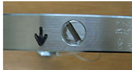
FIG. NO. 1 DLS-001 WITH ARROW MARK TO MATCH FLOW DIRECTION

i. Cover the adjustment screw of the needle valve with the security cap. Wrap the free-end chain of the security cap around the stem of the needle valve [Ref. Fig. No. 5].