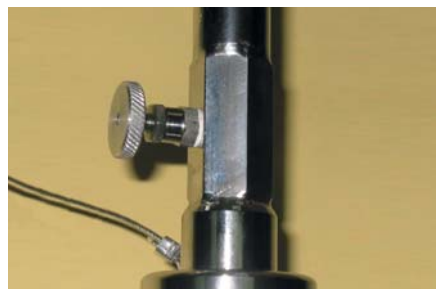
FIG. NO. 4 NEEDLE VALVE AND CHECK NUT