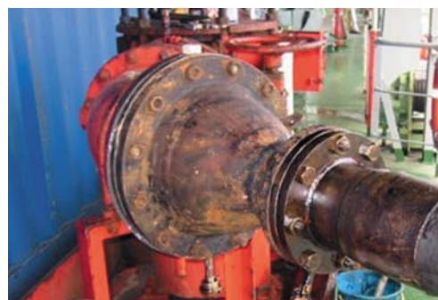
REDUCER FITTED TO THE SHIP MANIFOLD

There are occasions when sample drawing with the Line Sampler may be affected by vacuum. Usually this occurs where the larger size of the ship manifold with high free board is connected to a smaller barge supply line. This vacuum problem can be dealt with by fitting a 'reducer pipe' at the ship manifold or by carefully throttling the ship manifold bunker valve.