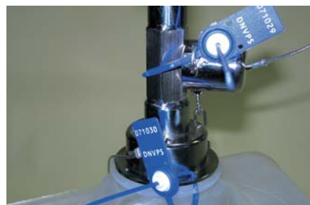
FIG. NO. 5 SEALING OF NEEDLE VALVE