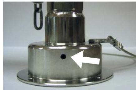
FIG. NO. 2 TELL TALE HOLE ON METAL CAP