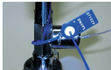
FIG. NO. 3 CUBITAINER AND SEAL