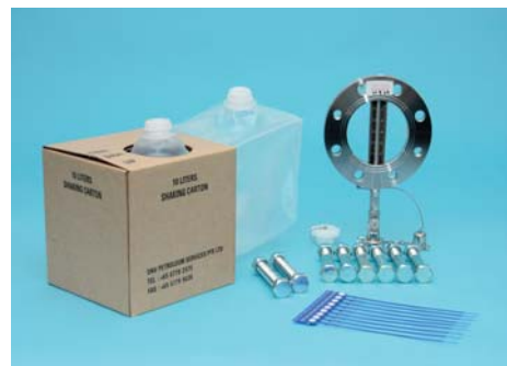
DLS 001 ACCESSORIES

These additional accessories can also be fitted on our basic model DLS 001 without any modification and they can be ordered separately by using the DNVPS sampler order form.