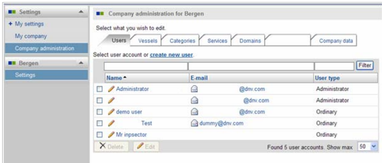
Figure – Brix Security Administration Web

Brix Security integrates with directory services such as Active Directory or uses its own identity store. Runtime authentication against Active Directory is supported. Brix Security integrates with corporate Customer data stores.